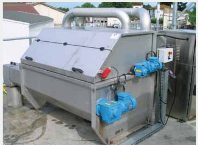
TE 9020 Fine Drum Screen with screw compactor