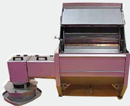
Fine Drum Screen covered, with screw compactor and bagging unit

speed during the free fall through the drum, carries on an efficacious back-washing of the screen openings. Depending on raw water composition, a self cleaning nozzle set is recommended, to clean periodically the drum from the in side with high pressure water. The portion of the drum screen being fed is always perfectly clean. Moreover, the back wash operation avoids the mucilage formations inside the cylindrical screen. A screw compactor for dewatering of coarse material with an endless storage bag is part of the INECO™ screen. The stand alone unit is equipped with inlet and outlet flanges.