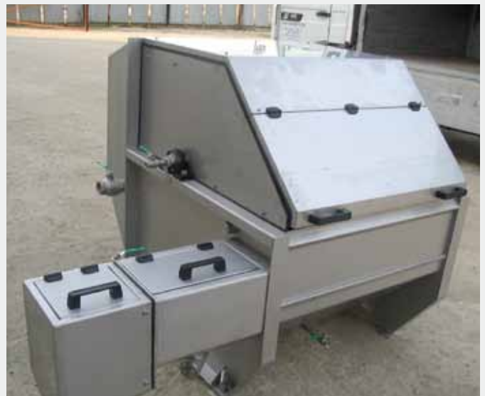
Covered Fine Drum Screen TE 6005C, screw conveyor and screw compactor