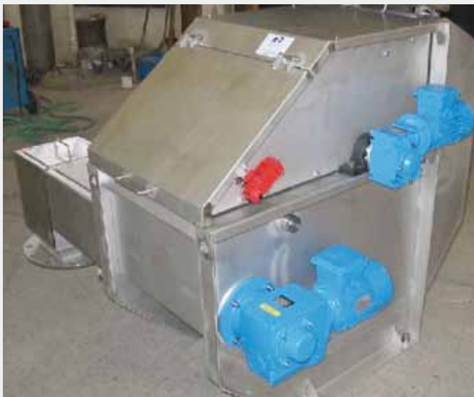
INECO™ TE 6010 with screw compactor, completely enclosed

industry, grit removal, scum dewatering, sludge screening, fruit and vegetable processing, poultry processing, meat packing and more